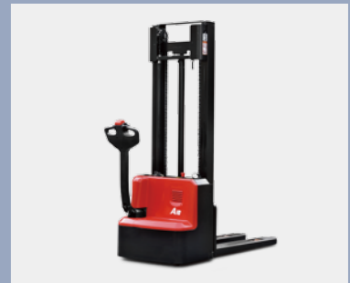
Optimized designing structure to offer a good visibility and easy entrance to the pallet