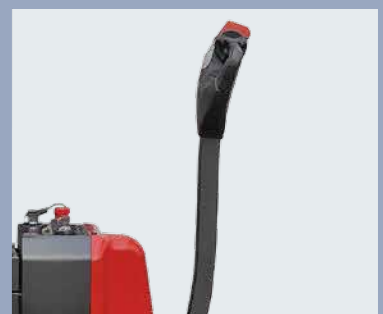
Simple and beautiful tiller designed to improve the operator's driving comfort