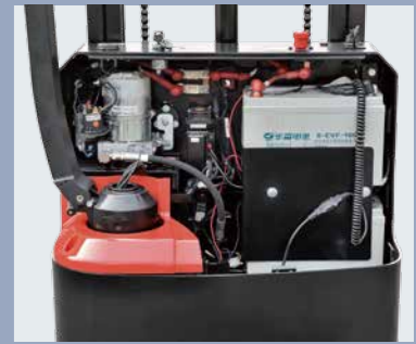
Fully opened hood, easy accessibility of all components, is easy for service