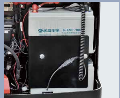
Built-in charger and maintenance free gel battery, you don't need to worry about them